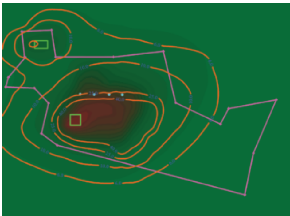
Figure 1: Isopleth showing odour impact from a facility without odour abatement.

Analytical methods exist for measuring odour intensity, tone and strength. The unit of measurement is calculated using dilution to threshold calculation (level at which odour is just detected) and can be expressed relative to volumetric measurements or units of time. The impact can be represented on a map using contour lines for odour strength (known as isopleths) at specific locations (see Figures 1 and 2). Odour mapping can be used to demonstrate the impact of odour abatement technology on, in, and around an odour-generating site and the impact at nearest